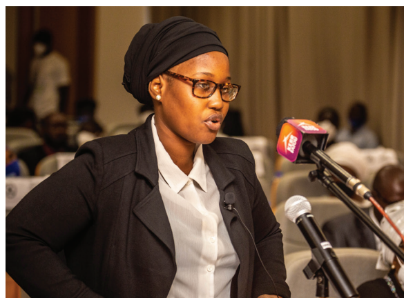
Highlights of the Moot Court Final