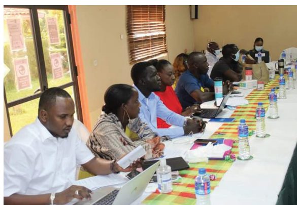
Commissioners and Staff of the Commission during a discussion at the retreat