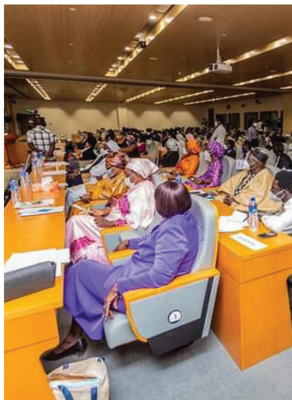
Dignitaries during the Moot-Court Final