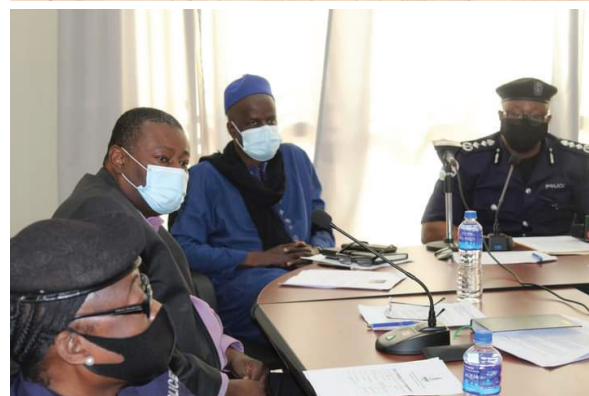
NHRC and the Police (including their leadership) during the validation of the code of conduct