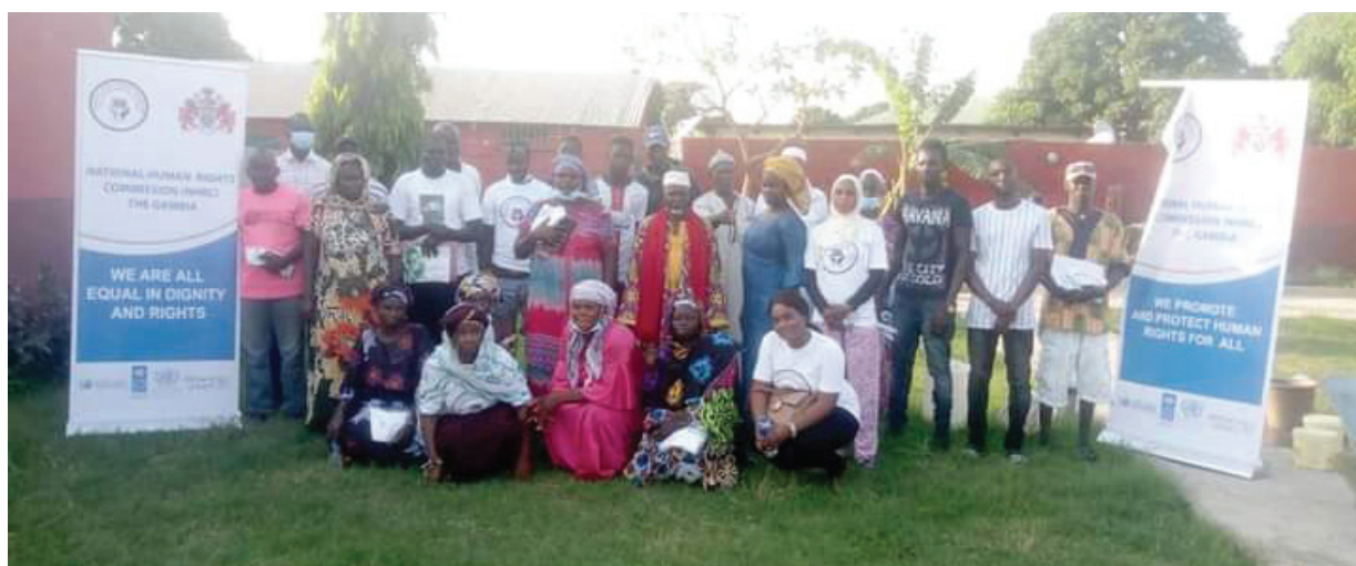
Participants during the outreach sessions