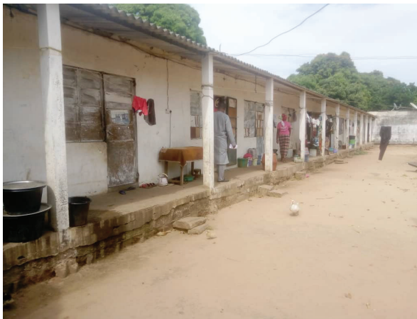
Living quarters of prison officials at Jeshwang Prison