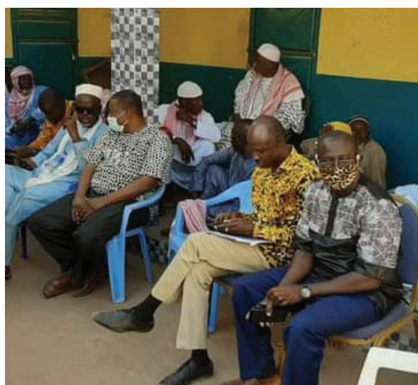
Commissioners and Staff of NHRC engaging with communities in URR

These visits led to the creation of a task force, comprising representatives from the Ministry of Interior, Ministry of Justice, Ministry of Lands and Regional Government, Supreme Islamic Council, and The Association of Non-Governmental Organizations, has been established to look into issues relating to the caste system in The Gambia and find durable solutions to them. A Term of Reference and a comprehensive two-year work plan, which contains series of activities, have been developed to guide the work of the Task Force.