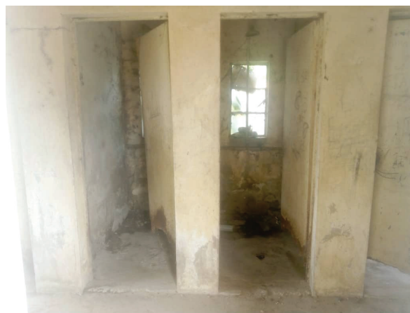
A bathroom at the Jeshwang Prison